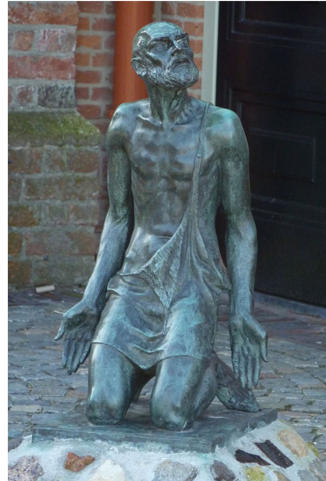
Job Talks to God, Noordwijk, Netherlands.

901 West Broad Street, Elizabethtown, NC 28337 (910) 862-3706